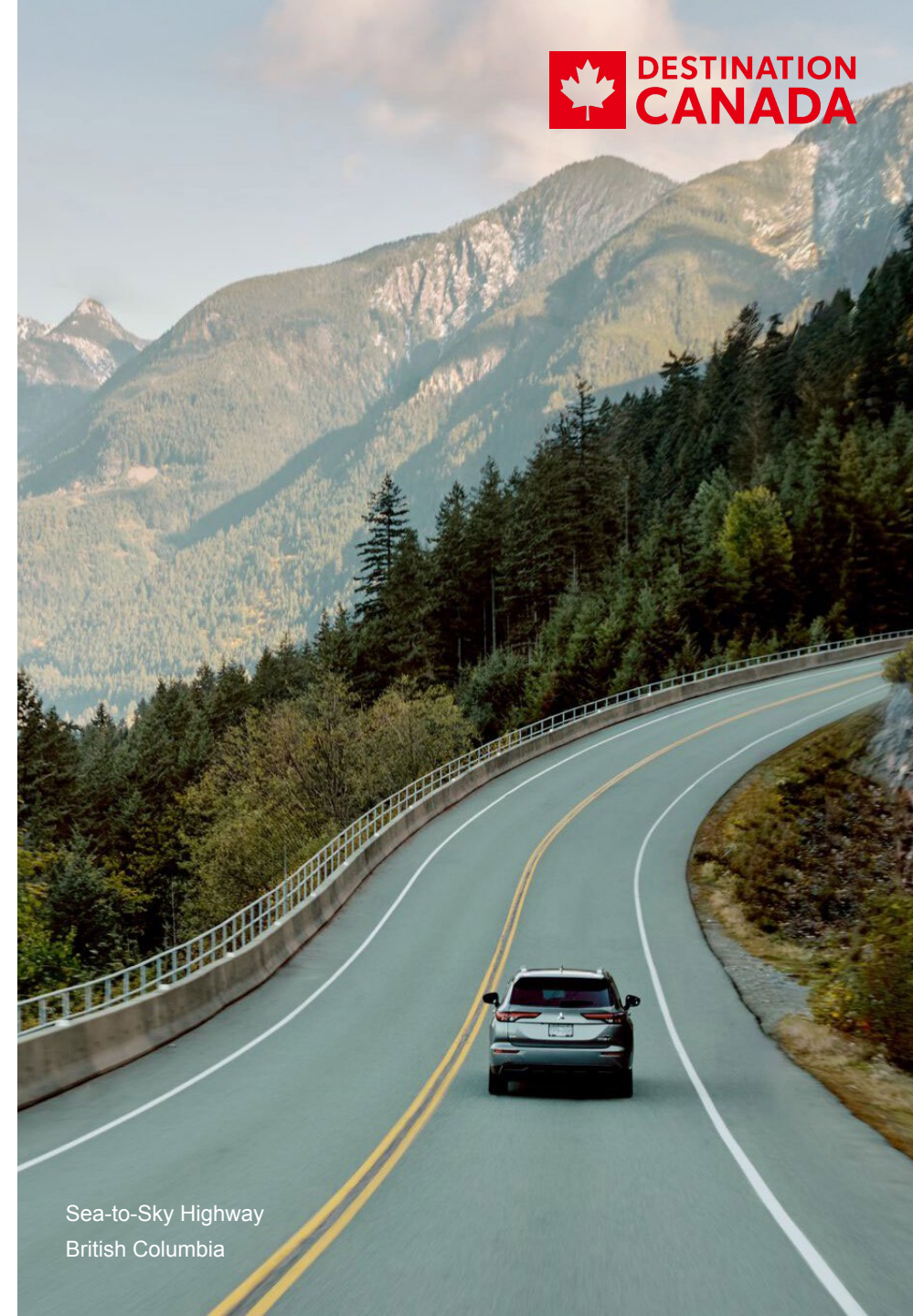
Sea-to-Sky Highway British Columbia

CTC's mandate is to market Canada as a premier four-season tourism destination in domestic and international markets. Activities include marketing campaigns, partnerships, research, industry engagement, and hosting events.