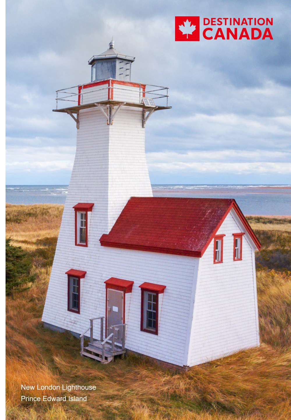
New London Lighthouse Prince Edward Island

CTC recognizes that due diligence is an ongoing process and continues to refine its approach in alignment with evolving federal guidance. It aims to further conduct supply chain mapping and review.